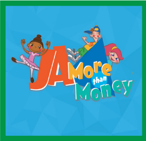
More than Money

In JA's newly updated A Business of Our Own program, grade 3-6 students put on entrepreneurial hats and run their own retail business. Students learn how to start a business, produce and promote their products, track their finances, and manage a team.