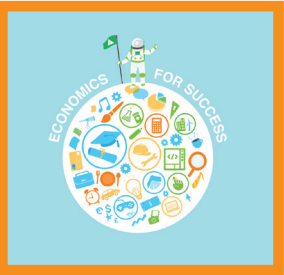
Economics for Success

Through the newly updated program, Grade 7-9 students get the vital tools they need to make smart financial decisions, live debt-free and become savvy investors. Students learn personal money management skills that they can apply to their lives ... beginning now.