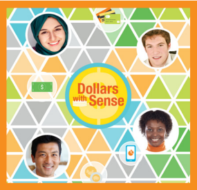
Dollars with Sense

In JA's Our Country - Technology and Innovation, elementary school students develop innovative, new ideas for business and society. They learn about Canada's technological past and present, as well as, share ideas that could become our next great innovation.