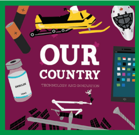
Our Country – Technology and Innovation

Our Community – Needs, Jobs, Tools gives elementary school students the building blocks for a successful career – right here at home! The program shows students how business shapes our lives and strengthens society.