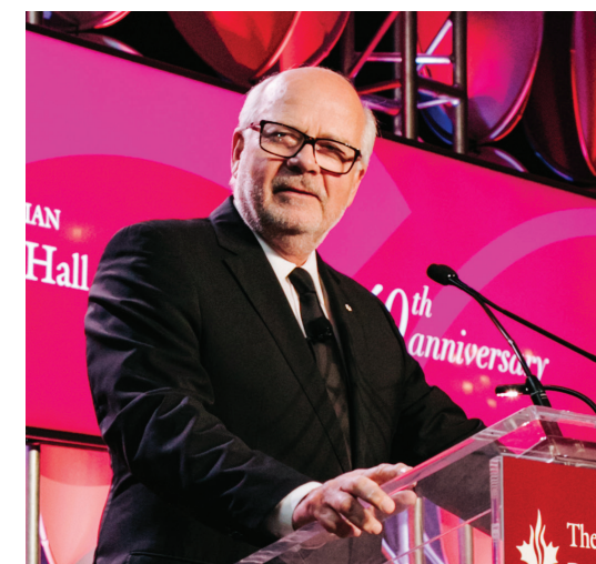
Peter Mansbridge Master of Ceremonies