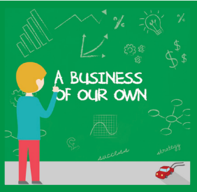
A Business of our Own

In JA's newly updated A Business of Our Own program, grade 3-6 students put on entrepreneurial hats and run their own retail business. Students learn how to start a business, produce and promote their products, track their finances, and manage a team.