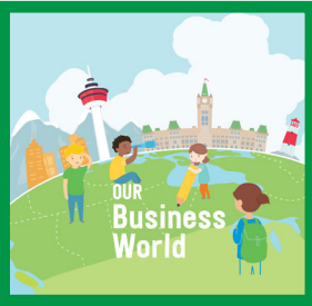
Our Business World

The JA More than Money program teaches elementary students about earning, spending, sharing, and saving money.